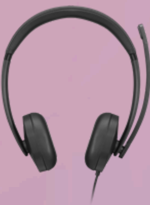
Lenovo Wired VoIP Headset 5000 4XD1R88995

Please click here to view the full list of accessories.