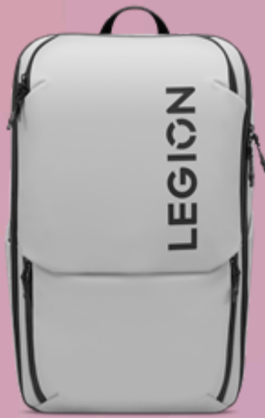
Lenovo Legion 17" Gaming Backpack GB800 (Light Gray) GX41U39300

Lenovo may not offer the products, services or features discussed in this document in all regions. Lenovo may withdraw an offering at any time. Consult your local representative for information on offerings available in your area. Lenovo reserves the right to change specifications or other product information without notice. Lenovo is not responsible for photographic or typographical errors. Lenovo provides this publication "as is" without warranty of any kind, either express or implied, including the implied warranties of merchantability or fitness for a particular purpose.