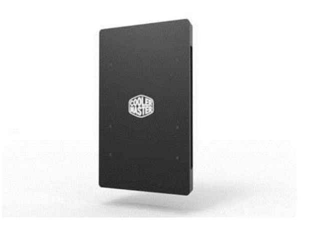
Or 2) require RGB control box ( sold separately)