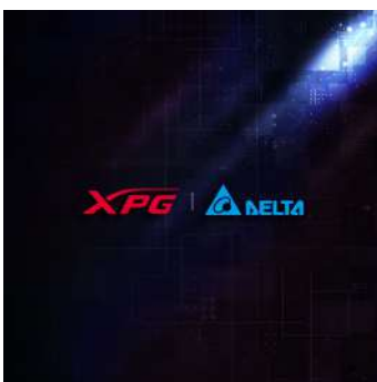
DESIGN COLLABORATION WITH DELTA ELECTRONICS

XPG FUSION 1600 TITANIUM is a premium grade Full-Digital power supply unit. It offers software based customization and data monitoring for a variety of user scenarios, ensuring the PC system can operate continuously and safely 24/7/365. To maximize efficiency and performance, XPG FUSION incorporates patented technologies from DELTA including a Planar Transformer and GaN FET solution. It also utilizes 100% Japanese capacitors at 105°C grade to ensure stability and consistency of power delivery. Certified Titanium by both 80 PLUS and Cybenetics, XPG FUSION 1600 TITANIUM is the ultimate consumer grade PSU.