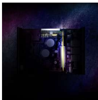
PATENTED PLANAR TRANSFORMER