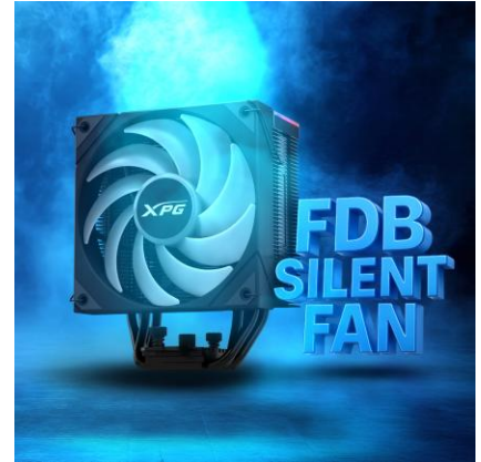
Efficient Cooling Under 22dB(A) in Avg.