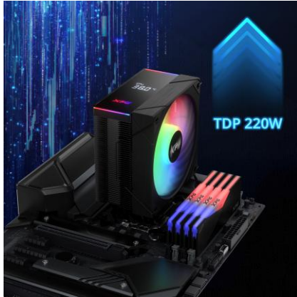
220W TDP to Unleash Full Performance