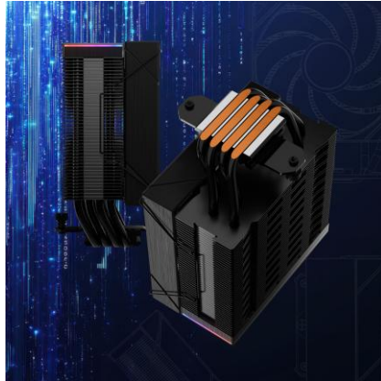
Single Tower Design with 4 Heat Pipes